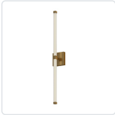
VL23532-BG-UNV Brushed Gold